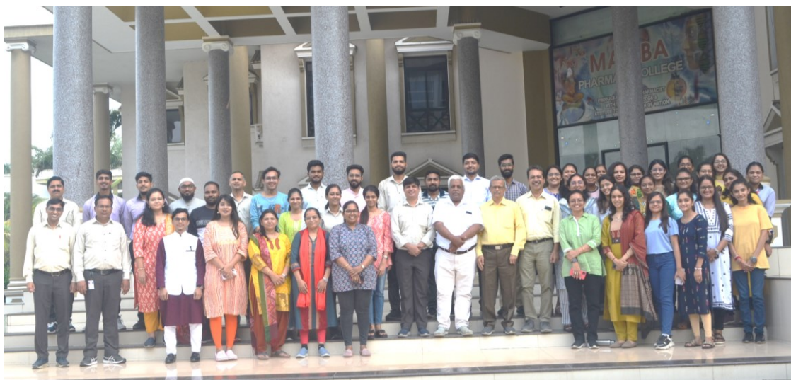
Participants, Organizers, Experts, Student and Faculty Co-ordinators