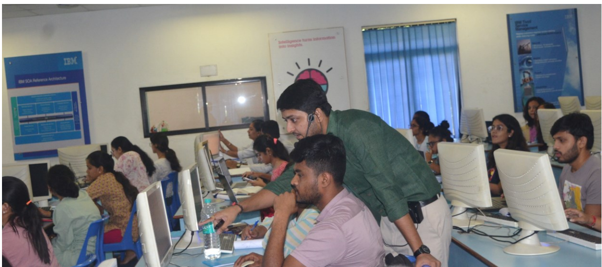
Programme in session with Audience- Expert(s) delivering lecture(s)